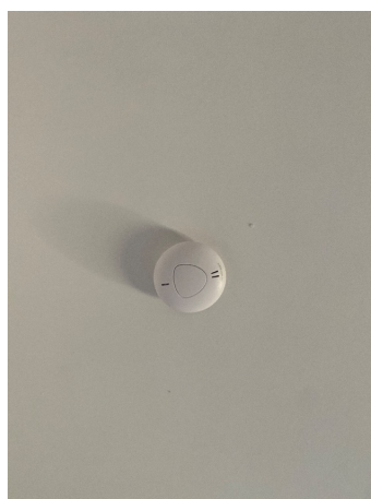
Smoke Alarm - 5