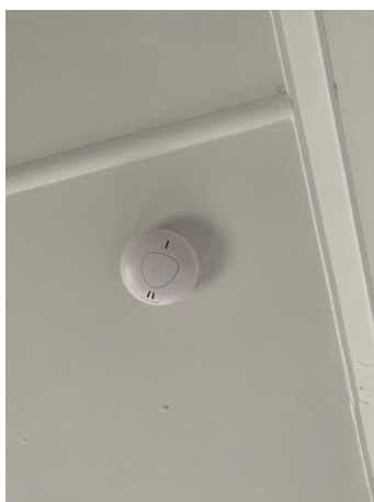
Smoke Alarm - 2