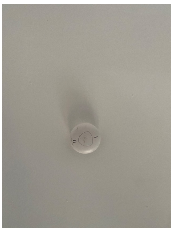
Smoke Alarm - 1