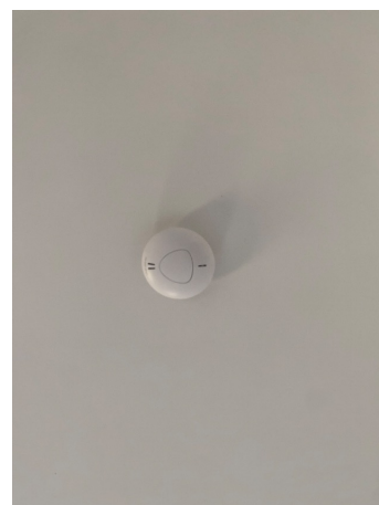
Smoke Alarm - 3