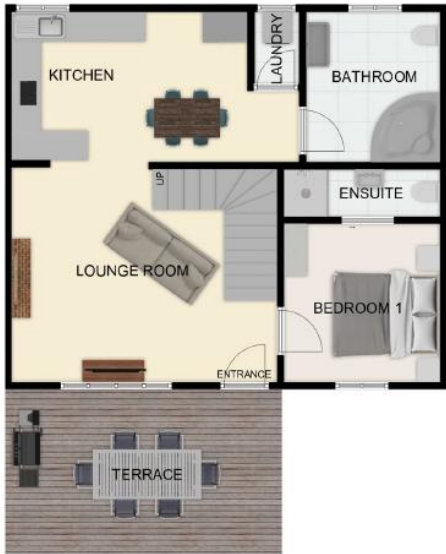
LOWER LEVEL Terrace with BBQ, living room, kitchen, laundry and bathroom, master bedroom with ensuite.